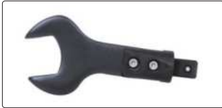
type A (optional)