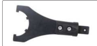
type UM (optional)