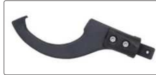
type C (optional)